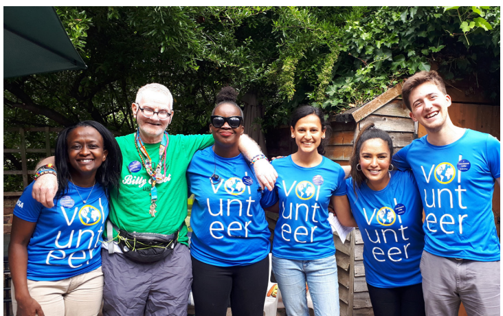
Visa at our Shirland Road Flats