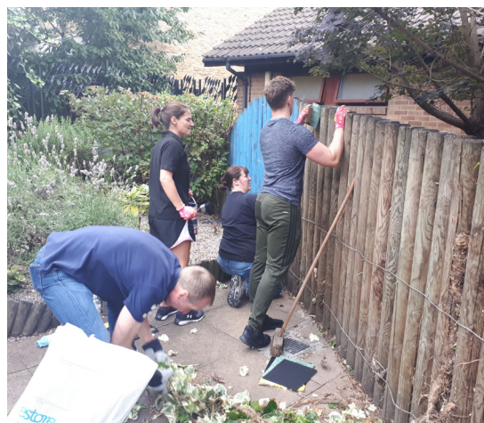
M&S International team at Harrow Road Flats