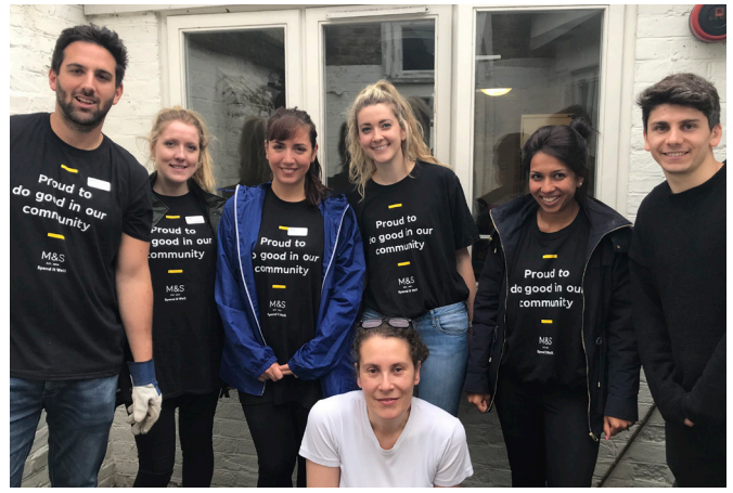
M&S Head Office at Rainbows Nursery

We also want to say a big Thank You to 4C Hotel Group for all their support throughout the year.