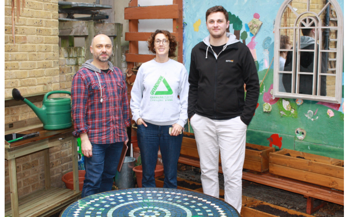
Groundworks creating our sensory garden