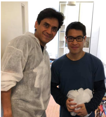
M&S Queens Park painting at our Drop-in