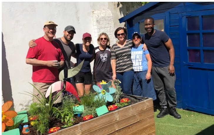
British Lands Volunteers at Rainbows Nursery