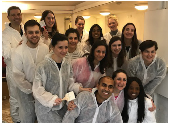
Vodafone painting at our Drop-in